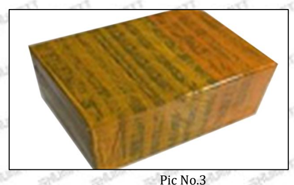
International express packaging: Wrapped with yellow tape after wrapping black protective film

Mob/Whatsapp: +86 13410541523 Tel: +8675523215133 Email: ruby@shumatt.com Website: www.shumatt.com